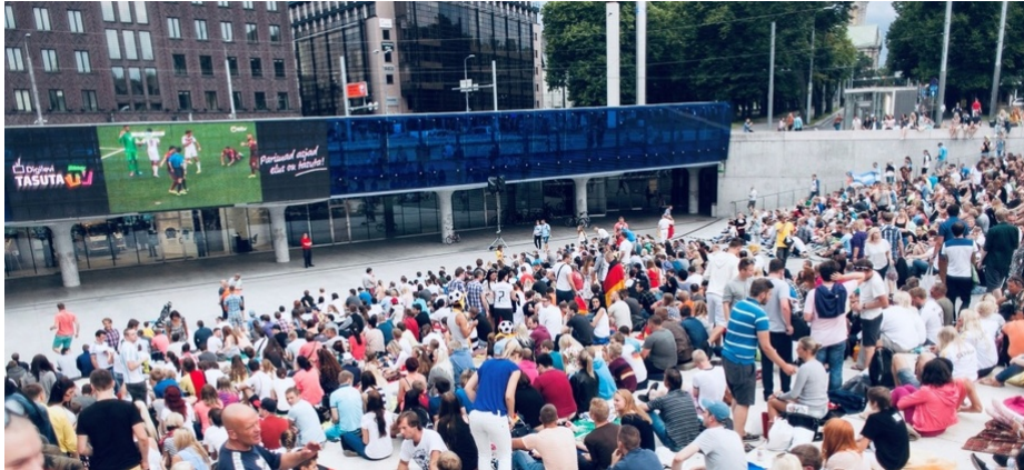
Watching football on Freedom Square

Did you know that from June 26, it is possible to see live broadcasts of the European Football Championship on the outdoor screen on Freedom Square in Tallinn? You can watch the thrills of the tournament and ERR Football Studio programs on the big screen.