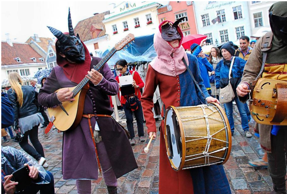
'Tallinn Medieval Days'