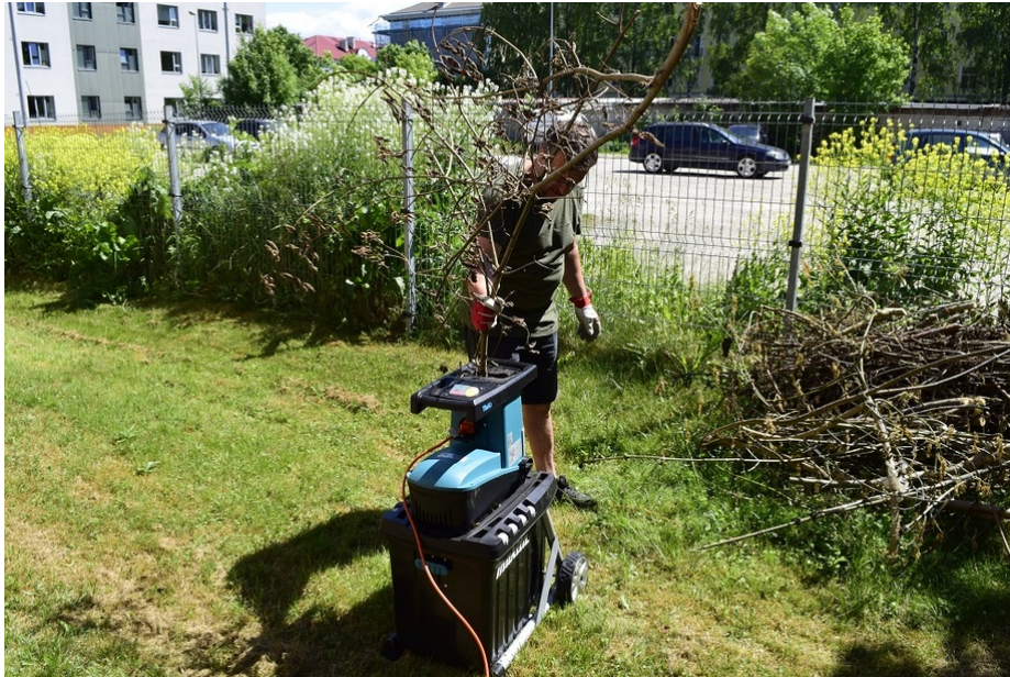
Toolbox of Pelguranna Library

For gardening enthusiasts, the Toolbox (Tööriistalaekas) selection at Pelguranna Library includes the most commonly used garden tools, such as a shovel, hoe, rake, various shears, and a lawn trimmer. You can also borrow a twig and hedge trimmers, and a branch shredder.