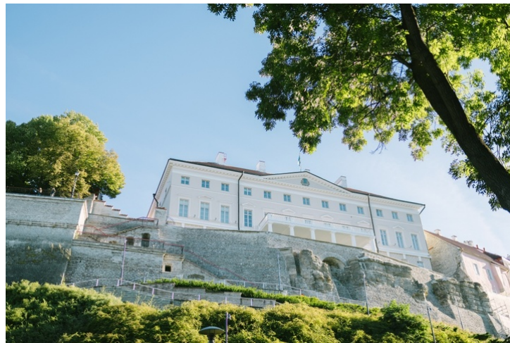
'Toompea' by Rasmus Jurkatam 2020

According to the European Environment Agency, Tallinn ranks fourth in Europe in terms of the quality of urban air, closely following Umeå, Sweden; Tampere, Finland; and Funchal, Portugal.