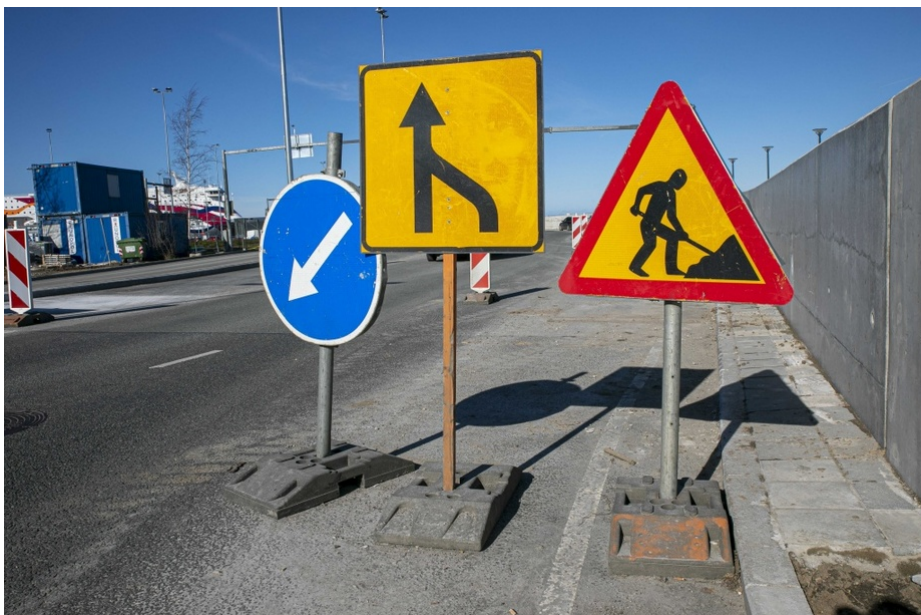
'Traffic signs during road construction' by Ilja Matusihi

On Monday, June 28, repair works for the intra-quarter roads of the City Centre district