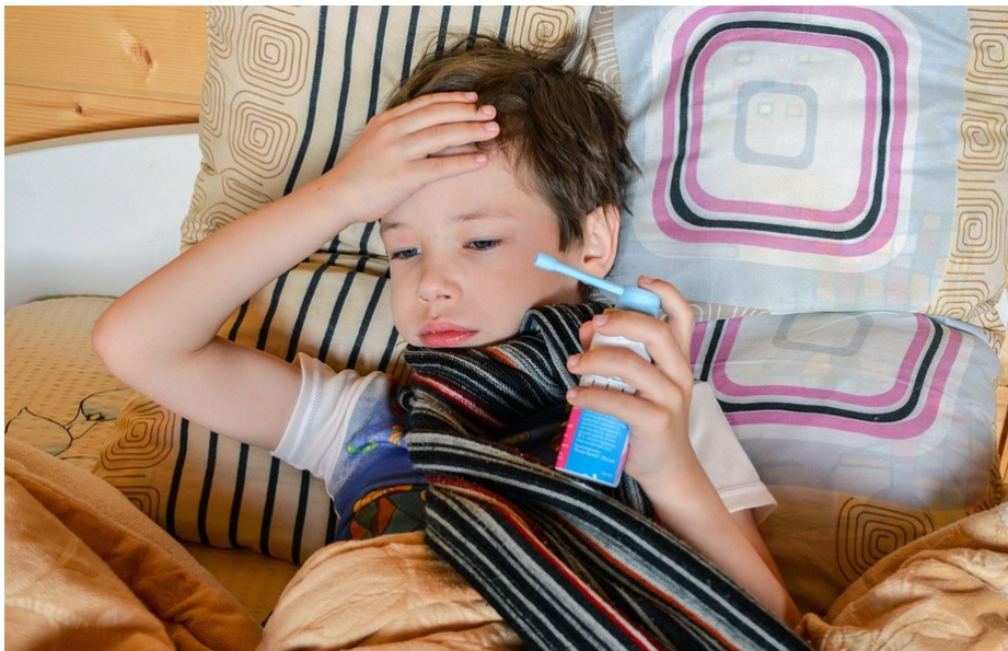
'Sick child medication'

In October 2020, the Tallinn Social and Health Care Department , in cooperation with the Tallinn Ambulance and the Tallinn Children's Hospital , launched a home doctor pilot project to provide medical care to sick children aged 0–12.