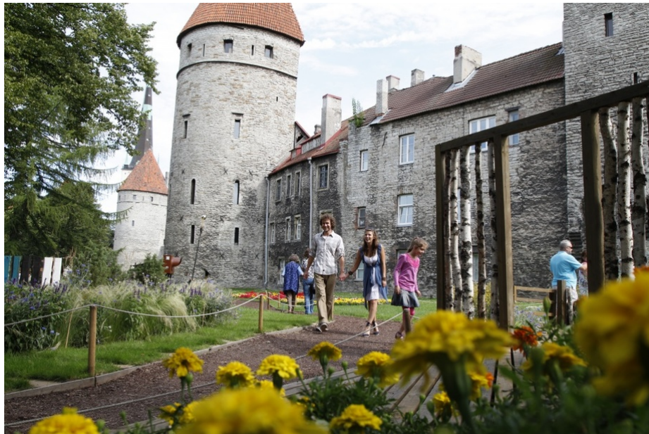
Towers' Square by Visit Tallinn

The city is supporting local businesses through the summer campaign " Discover Tallinn! ", which invites all Estonians to take part in the capital's diverse and cultural summer. The campaign's message is that there is a wealth of things to discover and places to explore in Tallinn, even for those who live here or have visited repeatedly.