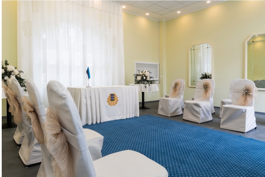
New ceremony hall of Tallinn Civil Registry Office

In the courtyard house of Õnnepalee (Pärnu mnt 67) , a new ceremony hall has been completed which ensures convenient access for people with reduced mobility. The renovated venue is open for ceremonies and the first reservations for the summer months have already been made.