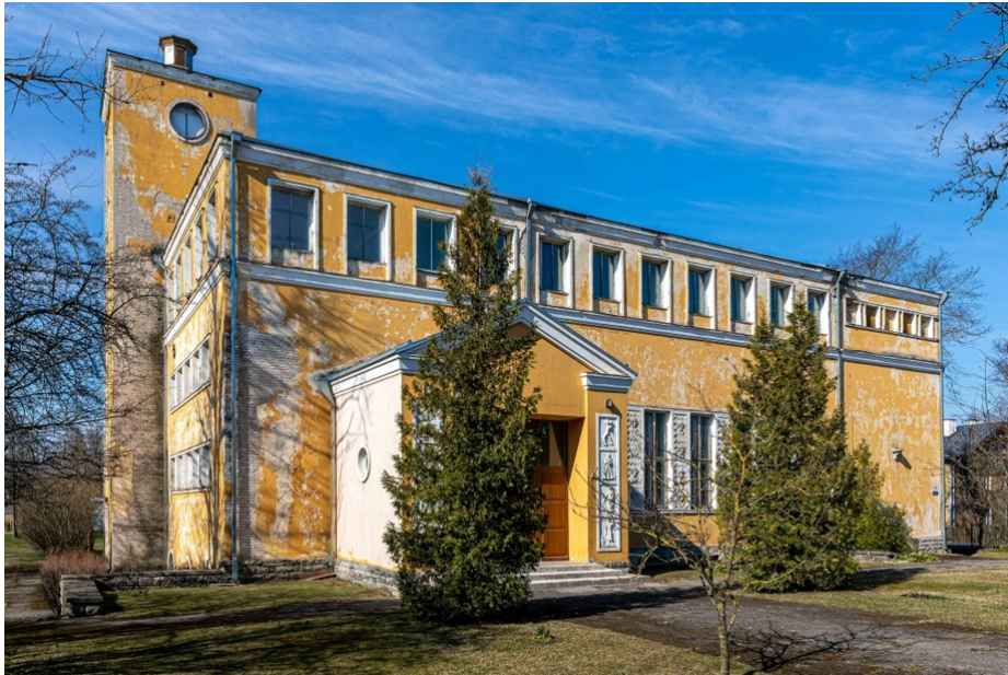
Kopli folk house

This Wednesday, June 9 at 6 pm, the garden gates of the Kopli folk house (Kopli 93) will be reopened and the custom of community Wednesdays will be re-established. The event is free; more information can be found at https://www.facebook.com/Kopli93 .