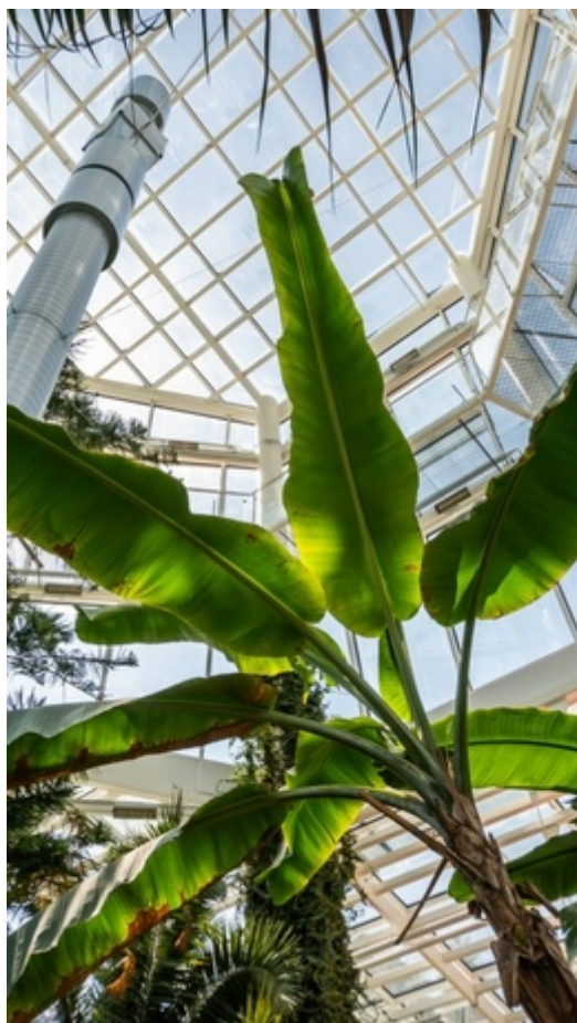
A view of Palm House

On June 8, the thoroughly renovated Palm House was officially reopened in the Tallinn Botanical Garden at Kloostrimetsa tee 52.