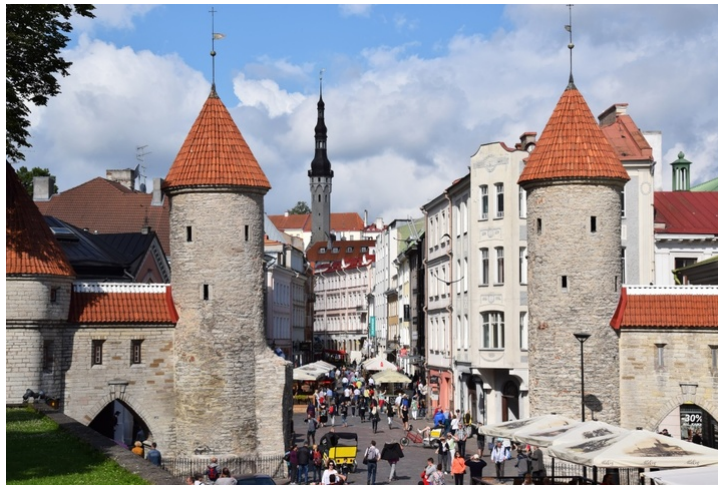
Old Town by Kadi-Liis Koppel

Despite the fact that The Tall Ships Races 2021 will be regrettably postponed until 2024, the city will still be holding a grandiose maritime festival (July 16-18) and several other traditional summer events such as Medieval Days (July 7-11), the Birgitta Festival (August 6-14) and the Old Town Days (August 12-15).