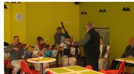
Concert by ensemble “Piibar”