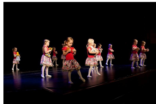
Singing day of "Ellerhein" girls choir