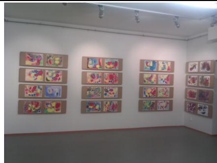
Exhibition by ABC studio