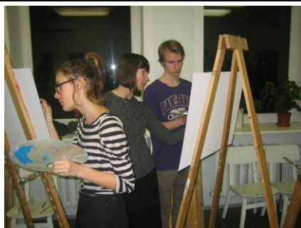
Preparation of art works by the students