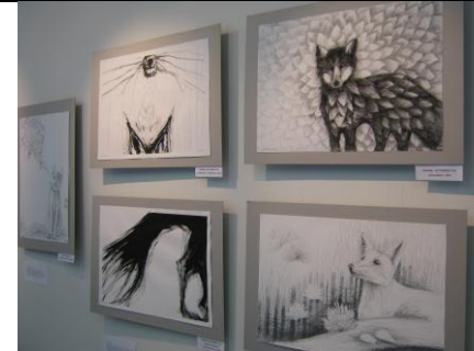
The exhibition by the students of Kullo art classes