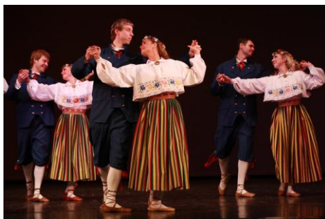
Concert by dance ensemble “Sõleke”