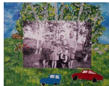
The final ceremony took place during the Independence Day celebrations in the Tallinn Methodist Church on the 22nd of February 2013. Art work of the family „The window to the grandmother’s childhood“ got the first prize in the art contest.