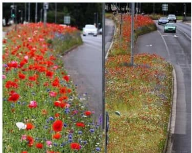
Rotherham, South Yorkshire, UK, "Metropolitan Borough Council have planted 8 miles of wild flowers along the verges. It has saved £25k in mowing costs"